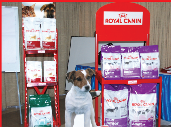
A display of the Royal Canin range of products