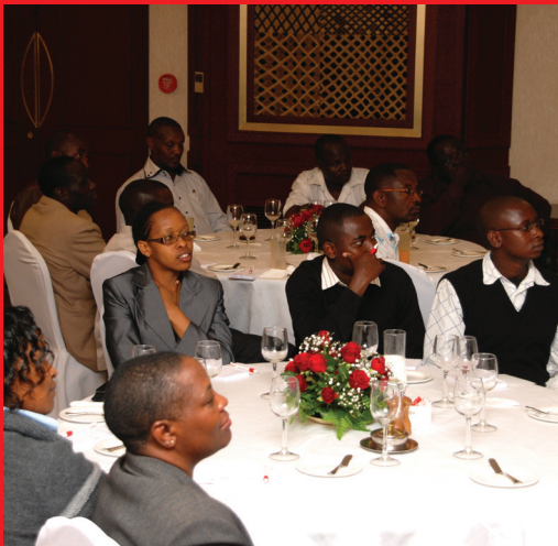
Veterinarians listening attentively