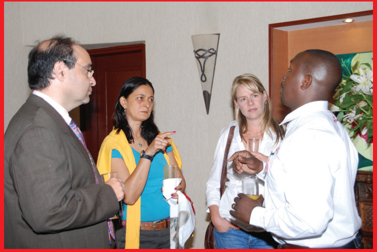
Guests have a drink and socialize before the presentation