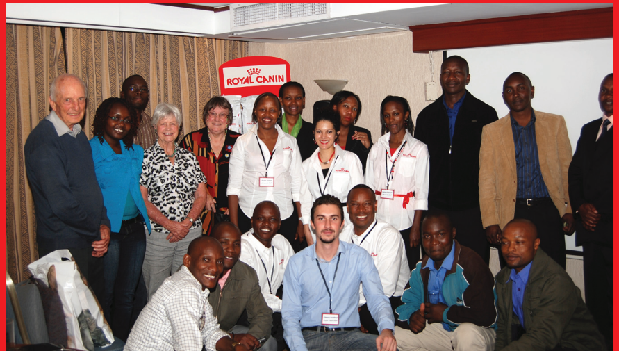
Group photo at Serena